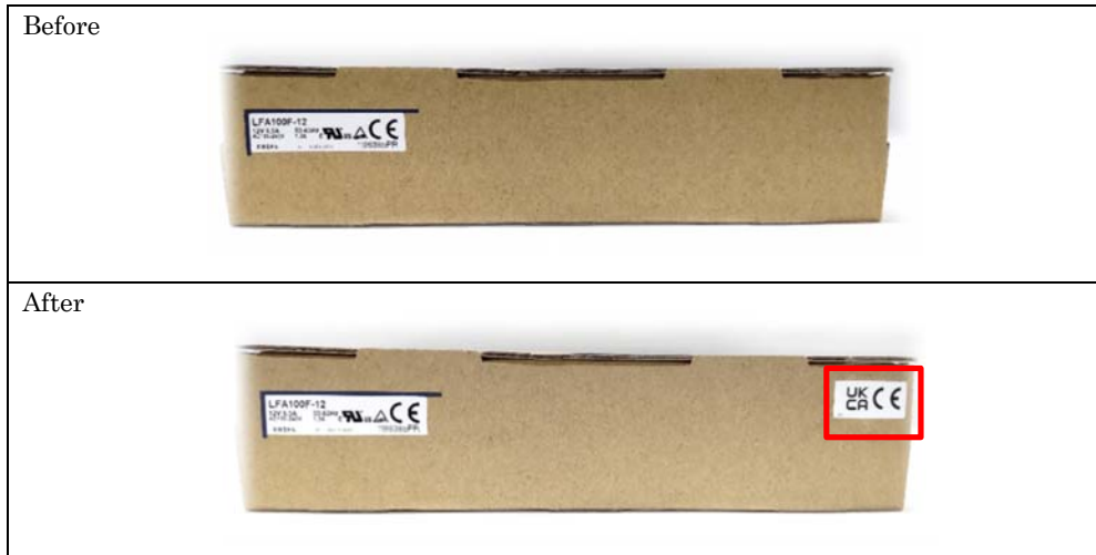
Fig. 1. Marking on a product carton box